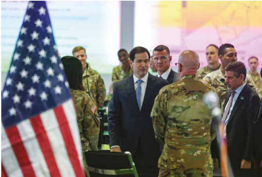
US Secretary of State Marco Rubio listens to US military personnel as he visits the Civil-Military Coordination Center in southern Israel

He confirmed that Israel would enjoy vetoes on the force composition, amid reports Israel