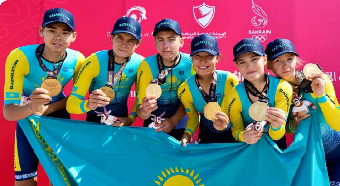
Kazakhstan's cycling team with their gold medals