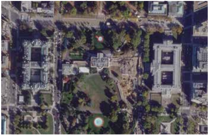
A satellite photo shows the White House in Washington, DC, after the demolition of the East Wing

North Korea has begun building a memorial