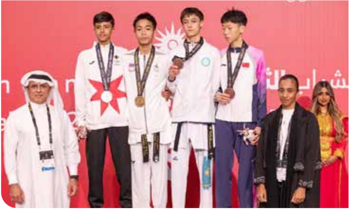
Yesterday's Taekwondo medallists