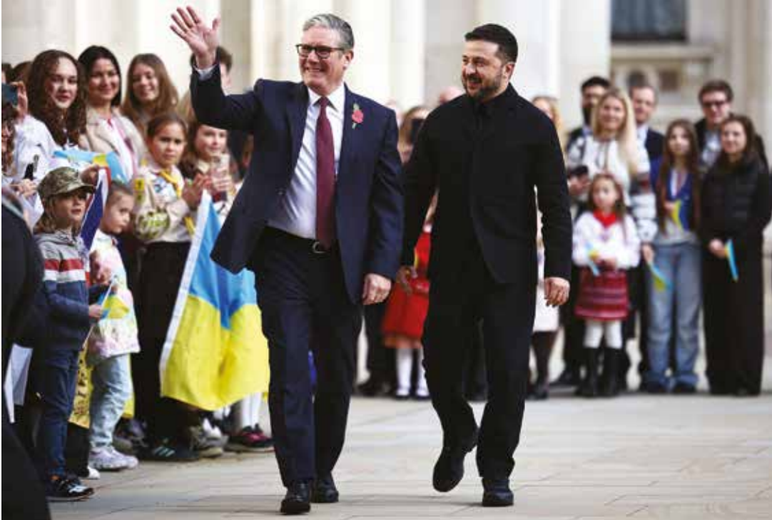
Britain's Prime Minister Keir Starmer and Ukraine's President Volodymyr Zelensky are greeted by Ukrainian school children

Kyiv's Western allies have raised pressure on Moscow as