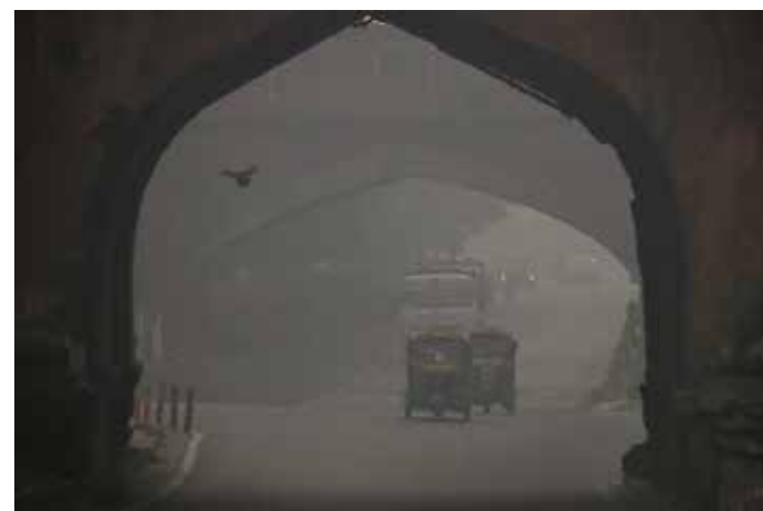
Commuters drive amid heavy smog early morning in New Delhi

flight for checking the capabilities for cloud seeding, the readiness and endurance of the aircraft, the capability assessment of the cloud seeding fitments and flares, and coordination among all involved agencies."