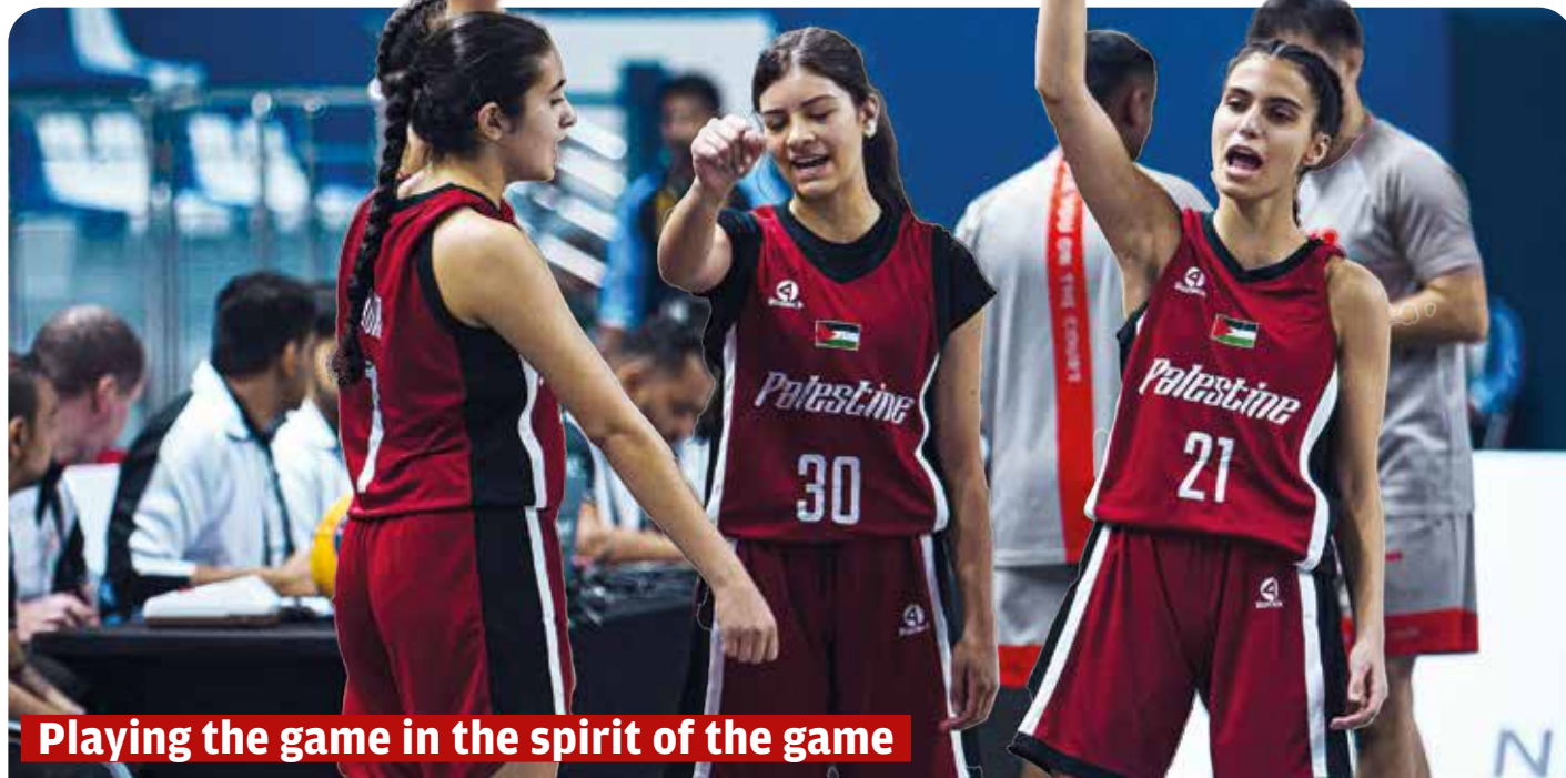
Playing the game in the spirit of the game