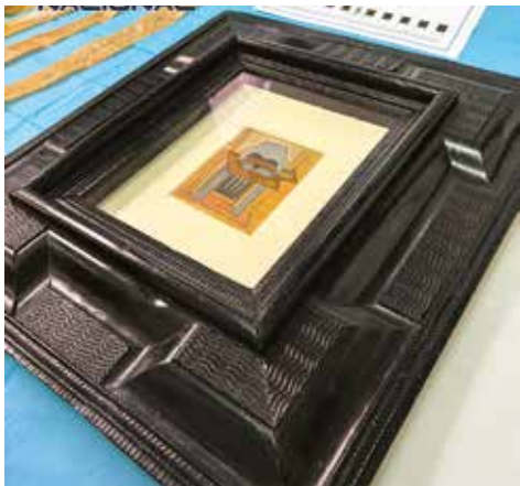
"Still Life with Guitar", a 1919 gouache and pencil work by Pablo Picasso

All items delivered by the truck had been under video surveillance since their arrival three days earlier, the CajaGranada Foundation said in a statement.