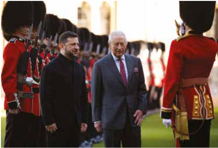
Ukraine's President Volodymyr Zelensky walks with Britain's King Charles III as they inspect a Guard of Honour

The UK will accelerate an air defense program to supply Ukraine with over 5,000 missiles, including 140 to be delivered this winter