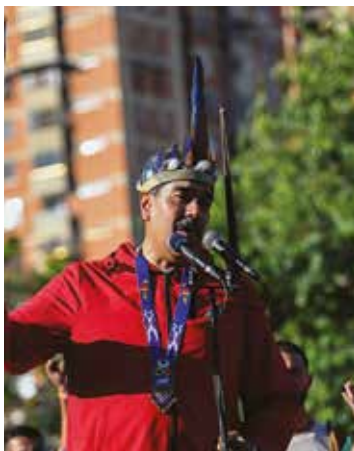
Venezuela's President Nicolas Maduro speaks during a march to commemorate the "Day of Indigenous Resistance" in Caracas (file photo)

The United States has deployed stealth warplanes and navy ships as part of what it calls anti-narcotics efforts, but has yet to release evidence that its targets -- eight boats and a semi-submersible -- were smuggling drugs.