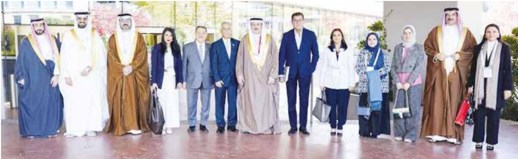
The delegation of Bahrain’s Parliamentary Division, led by Ahmed bin Salman Al Musallam, Speaker of the Council of Representatives, concluded its participation in the 151st Assembly of the Inter-Parliamentary Union (IPU) held in Geneva from 19 to 23 October. The Bahraini delegation participated in a series of meetings, including the IPU Governing Council and various parliamentary forums, focusing on issues such as gender equality, peace and security, sustainable development, and promoting dialogue and coexistence.

does not infringe on protected rights or international standards and noted that a longer period strengthens the right to object and seek redress. The Bahrain Bar Association welcomed the proposal, saying it would serve justice. Parliament’s Committee on Foreign Affairs, Defence and National Security backs the bill and, with all members in agreement, recommends approval.